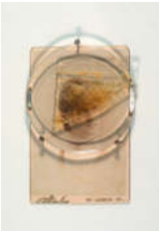
colleen choquette-raphael the flower eaters #12